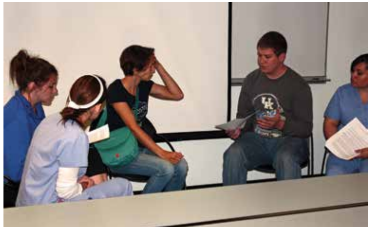
Students engaging in the Standardized Patient Simulation for iCATS.

The Physician Assistant Studies Program has a program in Morehead, based on the campus of Morehead State University. Students in this program did not participate in the core iCATS experience in Lexington because of the travel involved. However, to assure comparability in the educational programs at the two sites, CIHE staff worked with the PA Program leadership, the UK College