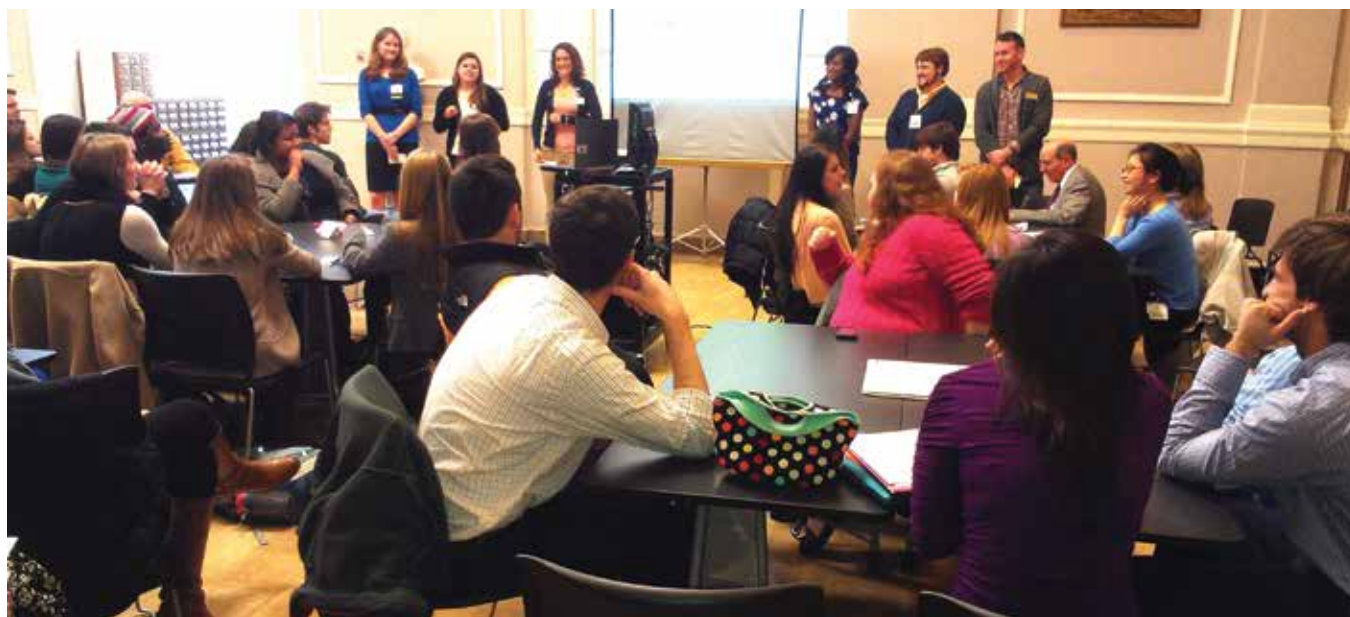
Final project presentations for the interprofessional small groups in DIHC.

Evaluation of this program is consistently, exceedingly positive. Students agreed that the course is valuable (M = 4.6), valued learning with other professionals (M = 4.8), and indicated that the experience enhanced their appreciation of the value of interprofessional work (M = 4.4). Importantly, students felt they improved their team skills (M = 4.2) and that the course helped them achieve their leadership goals (M = 4.5).