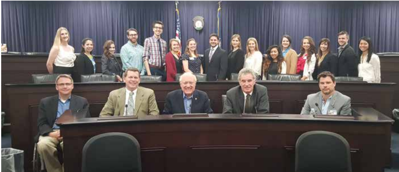
Leadership Legacy students visit Frankfort each year to participate in Political Advocacy workshop.

Currently, the Center is developing a co-rounding learning experience with the College of Medicine, the College of Nursing and the College of Pharmacy; a medication reconciliation learning experience with the College of Medicine and the College of Pharmacy; and a roles and responsibilities learning experience within Chandler Hospital's Surgery Department. The Center's Academic Leadership Committee recommended the formation of an ACIPE Work Group to aid in the identification and certification of ACIPE courses. The ACIPE Work Group has representatives from the Colleges of Medicine, Nursing, Pharmacy, Dentistry, Health Sciences, and Social Work. The ACIPE Work Group in collaboration with the Office of Clinical Contracting, has identified over 59 clinical sites where ACIPE could occur. In addition to identifying clinical sites, the ACIPE Work Group is developing a universal evaluation instrument that will assess IPE competencies across colleges, departments, and clinical sites.