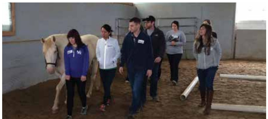
Leadership Legacy students participate in Herd Dynamics: Equine Guided Leadership Training.

Leadership Legacy: Leadership Legacy, another selective and highly successful program, celebrated its fifth year with another outstanding group of students and experiences. This highly selective, semester-long experience complements the formal curriculum by providing participants with a series of cohort-based activities in retreat, workshop,