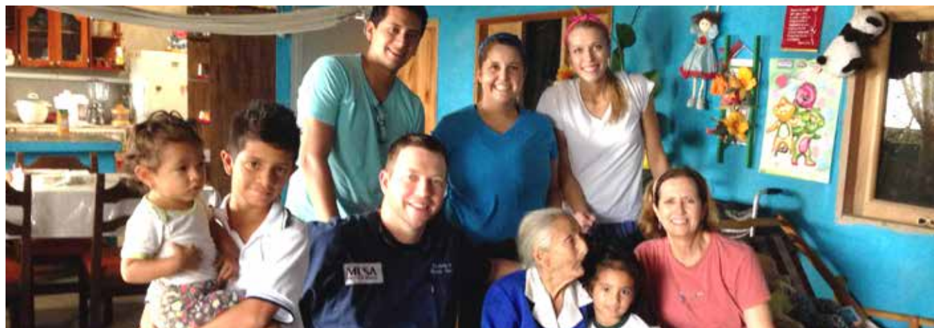
Students participate in brigades to provide health services in Ecuador as part of Interprofessional Teamwork in Global Health in cooperation with Shoulder to Shoulder Global.