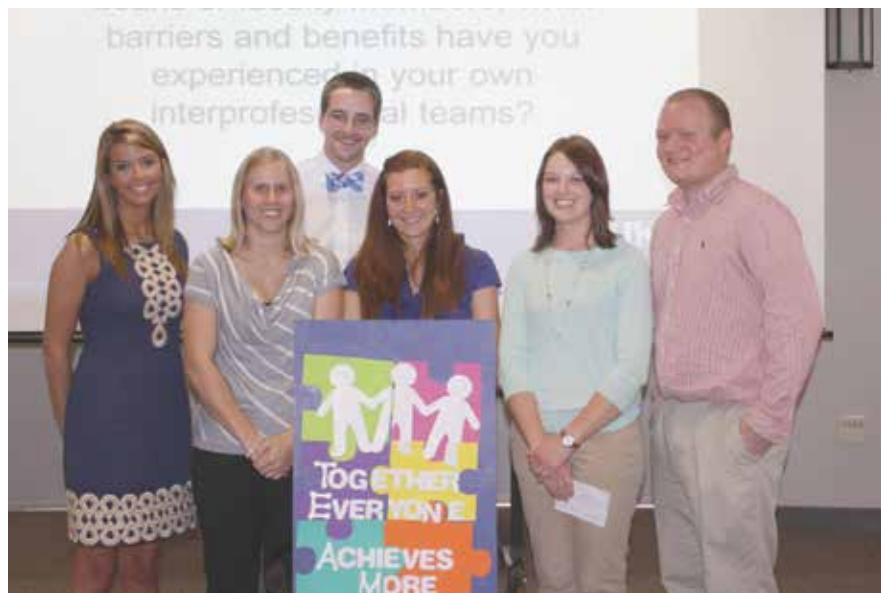
Students present final project in Deans' Interprofessional Honors Colloquium.

Collaborative Programs: One of the roles of the Center is to be a catalyst for faculty and staff to develop expertise in IPE and its application. The Center thus assists in the delivery of programs relevant to IPE and this involvement varies across each of the collaborative programs. It ranges from curriculum design assistance, evaluation services or consultation, to logistical support. Programs include: Interprofessional Teamwork in Global Health (IPTGH), Global Health Alliance, Emory Global Health Interprofessional Case Competition, and HIV Education Program