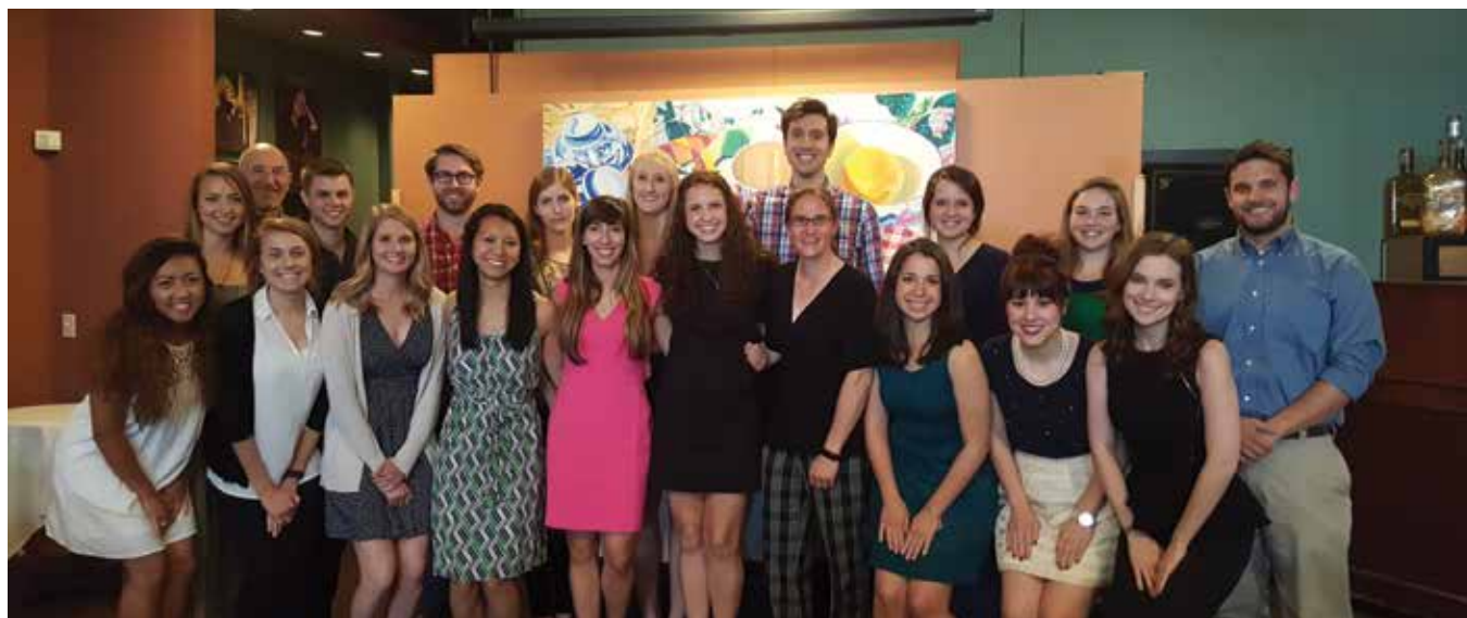
Closing ceremony & dinner for Leadership Legacy participants.

NOTE: The detailed tables at the end of this report include student and faculty participation statistics for each of the programs described above.