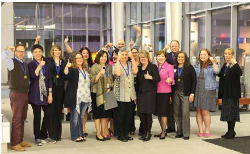
The inaugural class of CIHE's Faculty Associates & Fellows.

Effective IPE requires well prepared faculty members. Accordingly, from its inception, the Center has had a Faculty Development Committee charged with developing and deploying content that assists faculty members in acquiring the skills necessary to teach and evaluate the competencies IPE is designed to instill. This content includes both skills and knowledge. Group facilitation, for example, is a skill for which the committee has deployed an online module in collaboration with UKHC CE Central. The core principles of interprofessional practice are an example of knowledge important