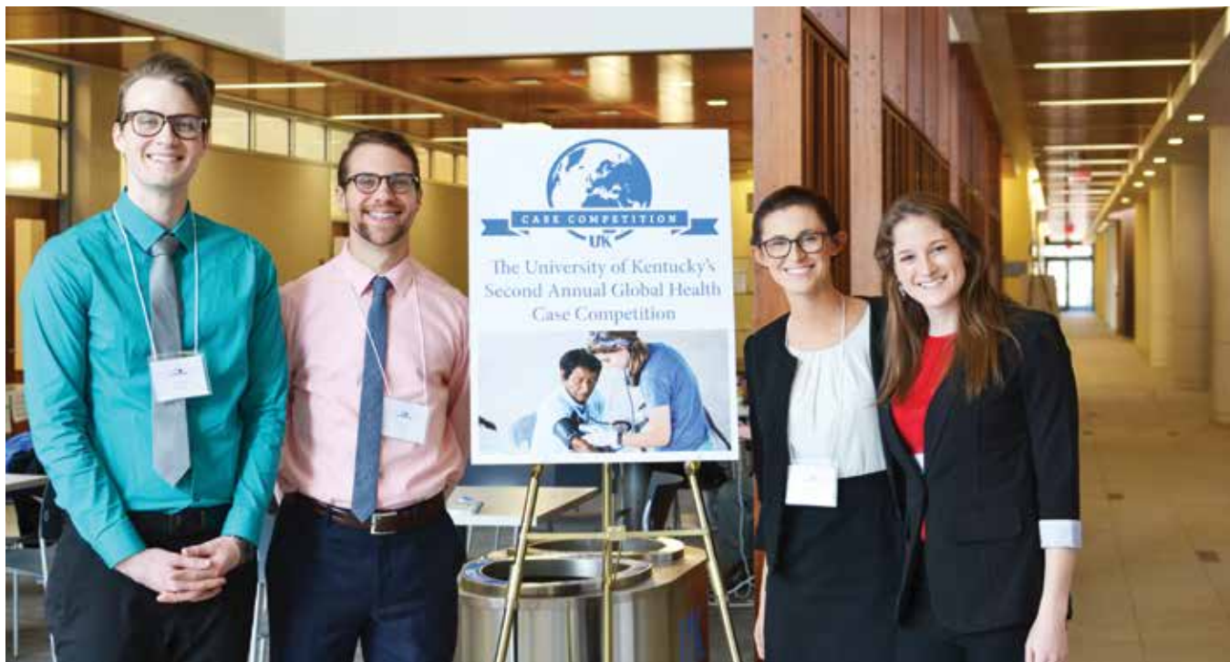
Students compete locally in the UK Global Health Interprofessional Case Competition and the winning team competes nationally at Emory.

Emory Global Health Interprofessional Case Competition: The Center was invited by the Assistant Provost for Global Health to support UK health professions students' participation in the Emory Global Health Interprofessional Case Competition. Mimicking the structure of the national competition, a local competition is held annually in which interdisciplinary student teams address contemporary global health issues and offer solutions. The competition statistics for 2015 included representation from ten UK Colleges, the four finalist teams included seventeen UK students, and the winning UK team placed second at the Emory National Global Health Interprofessional Case Competition.